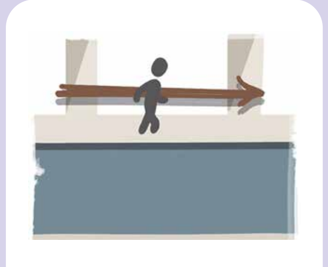
ead. Walk past the ...

Excuse me, I'm looking for a chemist. Can you help me, please?